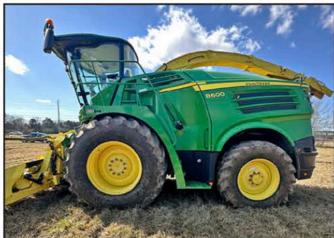
HAZEL GREEN, ALABAMA OWNER: BRAGG FARMS

WEDNESDAY, MARCH 20, 2024 SALE TIME: 10:00 A.M.